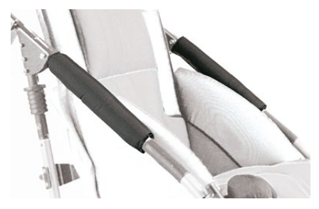
844 Side protecting covers