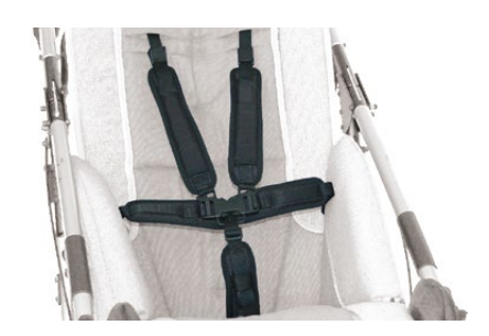
906 Five point harness