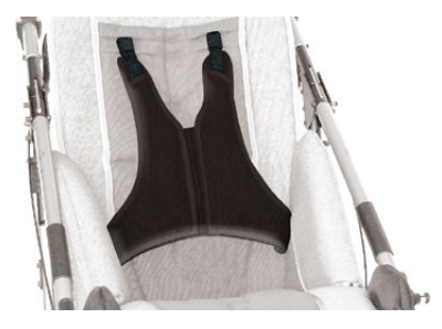
853 Vest harness