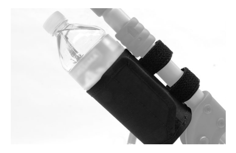
922 Bottle holder