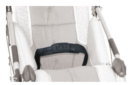
894 45° pelvic belt