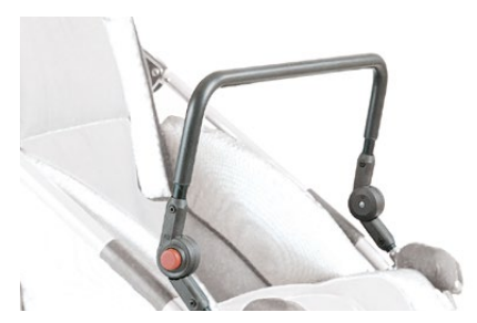
839 Front handle