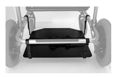
911 Vent tray