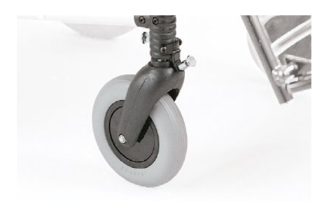
812 Directional locks for front wheels