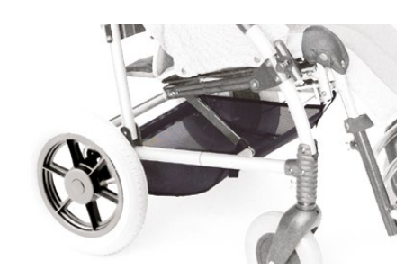
858 Net basket for 869 base