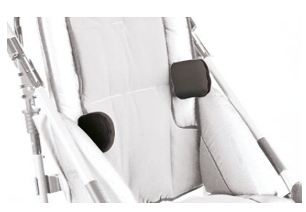
838 Lateral supports adjustable in height and width.