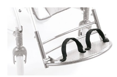
827 Foot straps