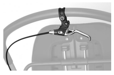
905 Hand brake