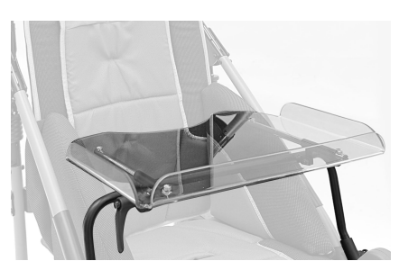
824 Transparent tray with recess.