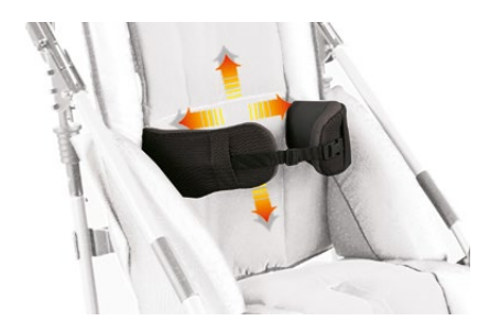
868 Wrappable and flexible trunk supports Adjustable in height and width.