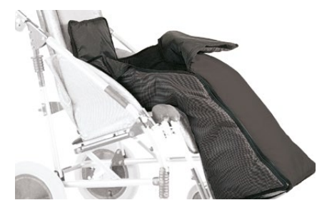
818 Thermal cover