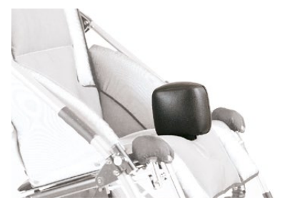
834 Abduction block adjustable in depth.