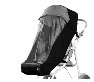
825 Rain cover to be fixed to the 819 canopy.