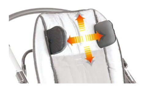
852 Headrest with parietal supports adjustable in height and width.