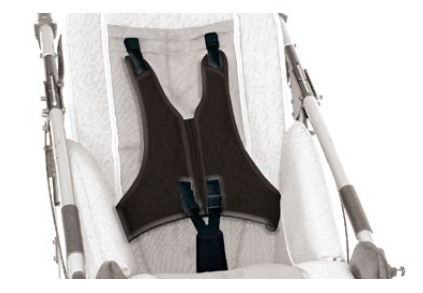
903 Five point vest harness