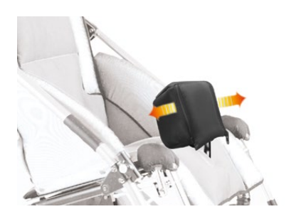
834-R Abduction block Adjustable in depth and abduction.