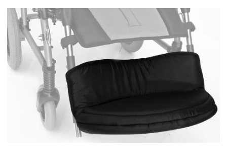
892 Covering for footrest