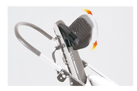
863 Headrest with occipital parietal supports adjustable in height, width, tilt and forward-backward.