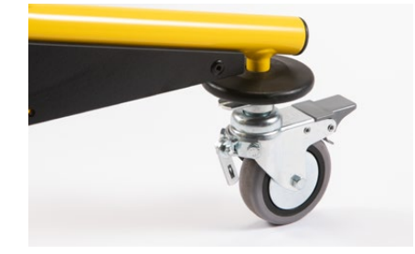
812 Directional locks for back wheels Helps the direction of the walking frame. Only for Indoor use.