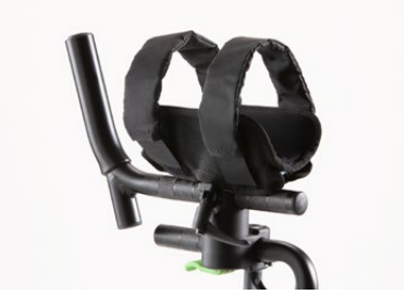
943 Arm straps With circumference adjustment.