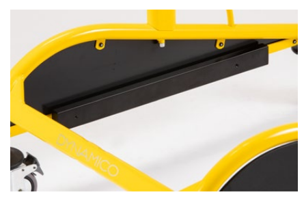
810 Weight bars Available for sizes 2, 3, 4 and 5. Size 2 + 2,5 kg. x 2 Size 3 + 3,1 kg. x 2 Size 4 + 3,7 kg. x 2 Size 5 + 4,35 kg. x 2