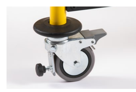
811 Adjustable brake for front wheels Helps the adjustment of flowability of the walking frame. Only for Indoor use.