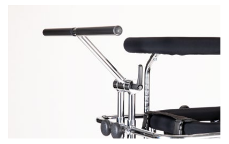
813 Adjustable handlebar With height and forward-backward adjustment. Alternative to 809 Arm support and 824 Tray.