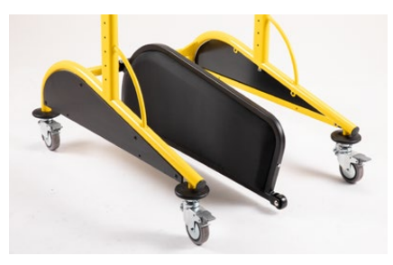
814 Leg divider Only for Dynamico Indoor use.

814E Leg divider Only for Dynamico Outdoor use.