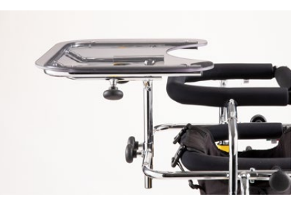
824 Transparent tray With circular recess. With height and forward-backward adjustment. Alternative to 809 Arm support and 813 Handlebar. Only for Dynamico Indoor use.