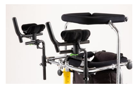
809 Arm supports With depth, inclination, rotation, height and pronosupination adjustment. Alternative to 813 Handlebar and 824 Tray.