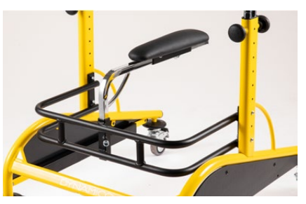
815 Abduction saddle Adjustable in height through holes and in forward-backward. Available for sizes 2,3 and 4. Only for Indoor use.