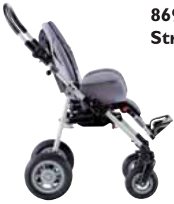
869-4-Wheel Stroller Base