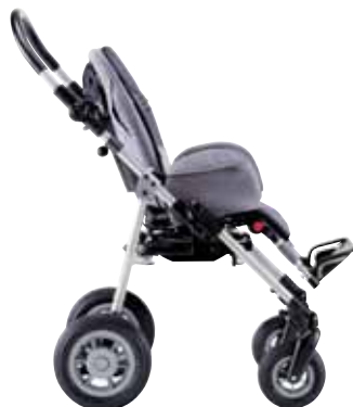
New BUG 4-Wheel Stroller Base