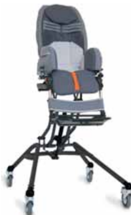
New BUG Hi-Low Feeding Base