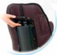
901-3-Wheel Jogger Stroller Base