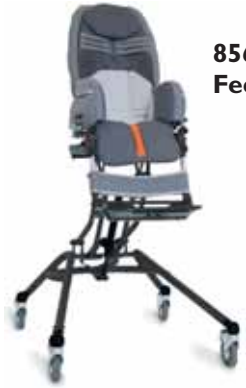
856-Hi-Low Feeding Base